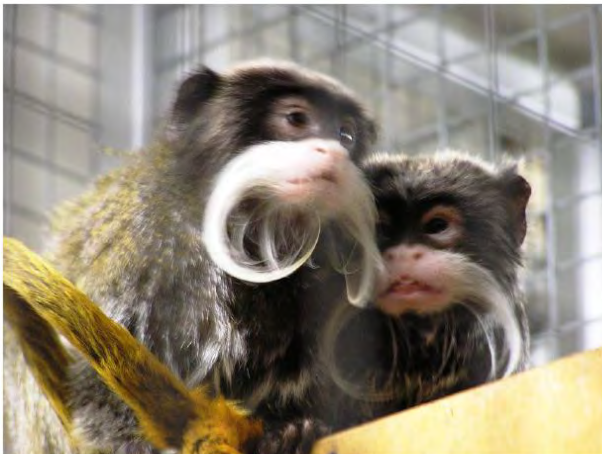
Two girls Cayenne (828) and Snoopy (925) at Como Zoo.