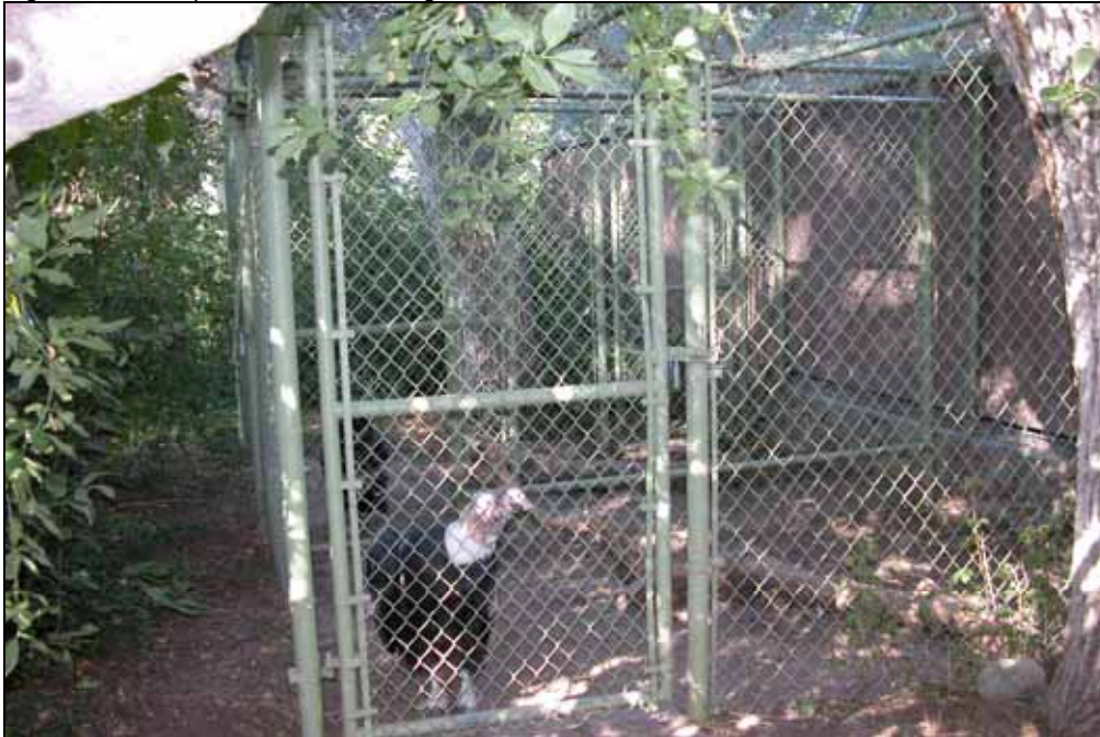
Figure 2C Example of condor holding enclosure

(S10.3.3) All animal enclosures (exhibits, holding areas, hospital, and quarantine/isolation) must be of a size and complexity sufficient to provide for the animal's physical, social, and psychological well-being; and exhibit enclosures must include provisions for the behavioral enrichment of the animals.